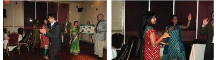
Game prize and lucky draw winners. Attendees enjoying music and dancing.