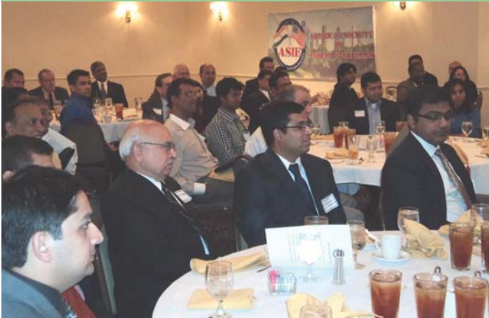
Attendees at October luncheon meeting