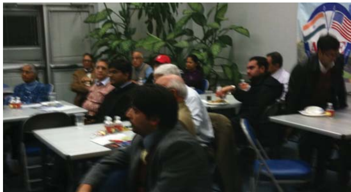
Attendees at the meeting

American General Life and Accident insurance Company (AGLA), www.agla.com , provides a wide variety of affordable and innovative life insurance, annuity, accident and supplemental health insurance products to millions of Americans. AGLA's innovative insurance solutions can help meet a lifetime of financial needs.