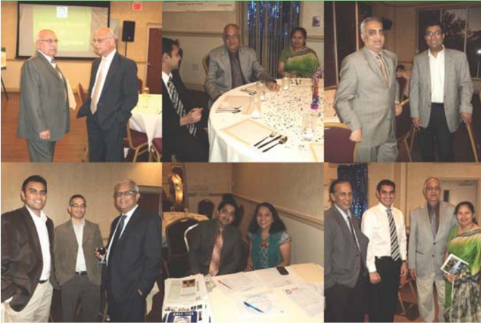
ASIE members, guests and supporters at the event