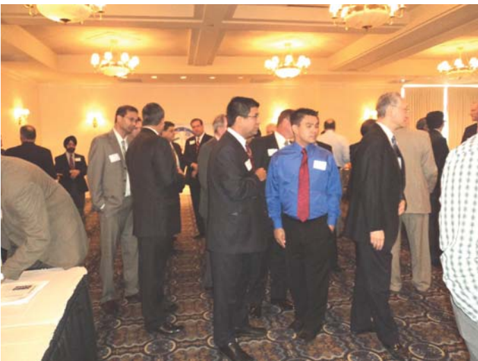
Networking at the event